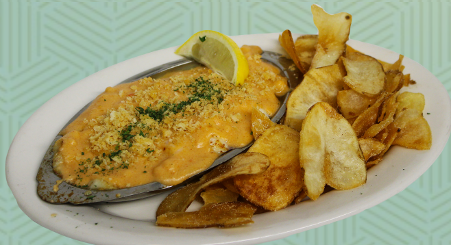
Baked Stuffed Haddock W/ Lobster Sauce & Homemade Chips